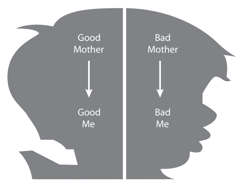
Figure 4.3 Transformation of maternal images into images of 'self'

and the breast as object. At that early stage both serve the same function. It is important also to remember that the mental activity Klein referred to is taking place at an unconscious level, and the Kleinian concept of phantasy is relevant here. Phantasy describes a different, more primitive kind of mental activity, composed of vague, often frightening images and sensations present long before the development of language. This is a term which is used very specifically in object relations theory and differs from the word 'fantasy', which usually refers to conscious mental activity. The word projection is also significant in relation to Kleinian theory, and describes the way in which the infant disowns everything which he or she experiences as 'bad'. These disowned parts of the 'self' are then attributed to the 'other'. Introjection is another term which Klein used more specifically than Freud, and refers to the process of internalising external material – especially external material relating to the mother. Aspects of the mother are monitored and metabolised in this way.